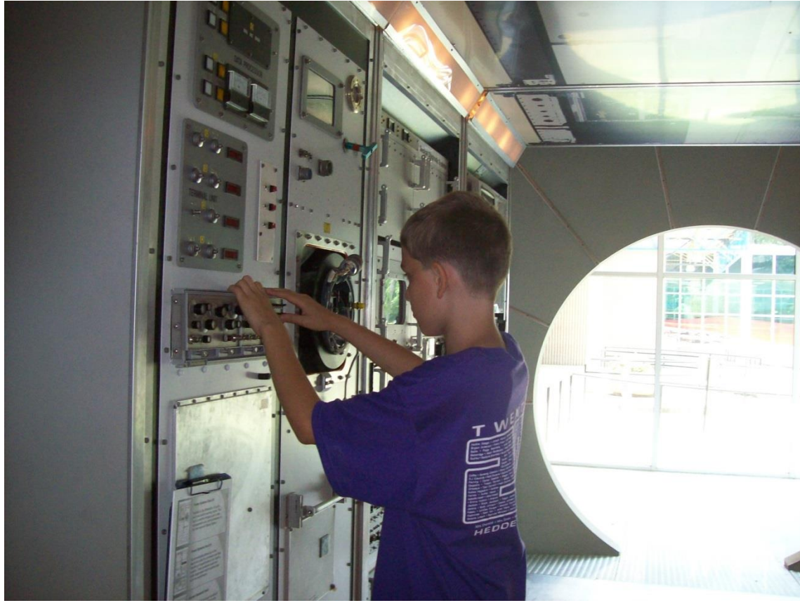
PRETENDING TO BE ASTRONAUTS ON THE INTERNATIONAL SPACE STATION