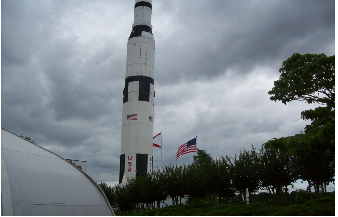
ABOVE: REPLICA OF A SATURN V ROCKET – STANDING SENTINEL OUTSIDE THE US SPACE AND ROCKET CENTER.